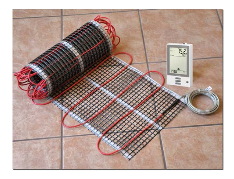
WarmWalk electric radiant floor heating for all types of tile floors

cold bathroom floor in the morning will appreciate this new product. Thermosoft's market entry leverages our fully integrated U.S. manufacturing base and the latest worldwide advancements in electric radiant heating technology. Our goal is to make underfloor heating, which was once considered a luxury, more widely available to homeowners. We offer low prices and a lifetime warranty to back up our product's superior position."